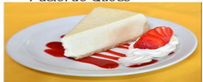
Pastel de Queso