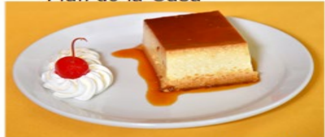
Flan de la Casa