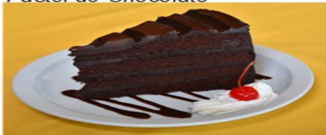
Pastel de Chocolate